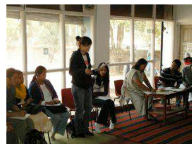
Critical thought and communication

Back in Japan, the post-program synthesis consists of several reflective meetings and the writing of a field trip report based on their team's field experiences and activities. A significant part of the "synthesis" occurs when students chat informally among themselves and with others on campus about their experiences in Nepal and what they would like to do for Nepali people and the environment in the future.